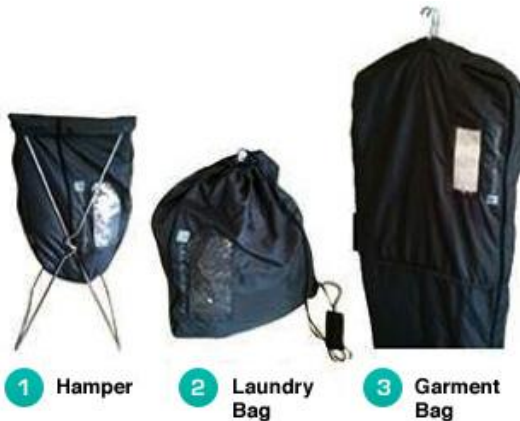
3-in-1 reusable bag converts from laundry hamper, to shoulder bag, to garment bag-no more plastic bags!

After the first order each customer will receive our revolutionary & most environmentally friendly 3-in-1 uniquely tagged laundry bag on the market.